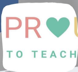
ProuD to Teach All